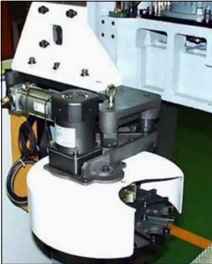
BT/CAT/ISO25, HSK32A BT/CAT/ISO30, HSK50E BT/CAT/ISO40, HSK63A